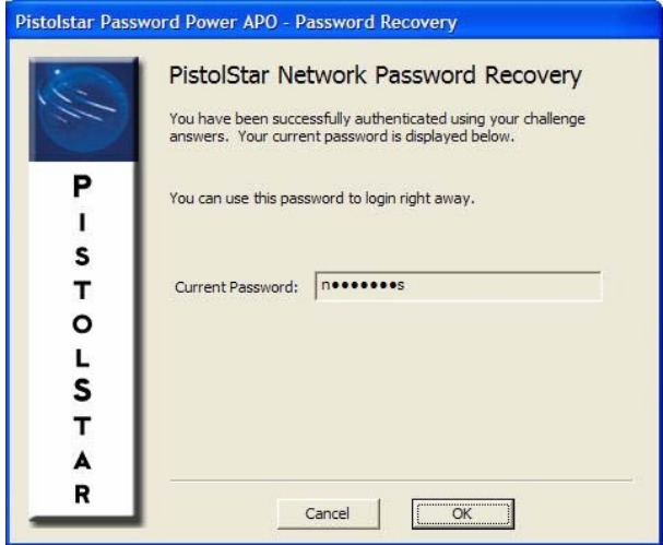
Administrators can choose to have a partial or complete password presented to end-user.

Maintain Control & Gain Flexibility ◆ Configure number of challenge questions end-user must answer for setting recovery information and later recovering their password ◆ Select a minimum length requirement for end-users' answers ◆ Require end-user to make a password change or present them with their current password (convenient for remote end-users) ◆ Choose whether partial or complete password is presented to end-user ◆ Store recovery information and password on LDAP and/or Local Registry